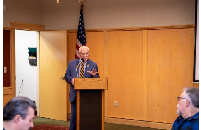
Congressman Paul Tonko speaking