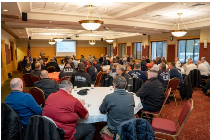
Many of the attendees at the Legislative