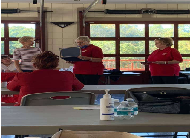
50 YEAR SERVICE AWARDS